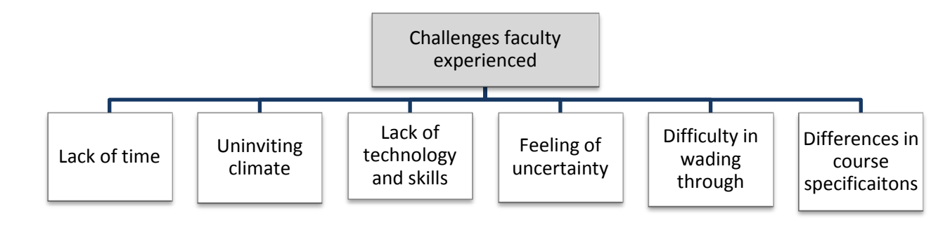
Figure 2. Challenges faculty experienced in implementing OER in their classrooms.